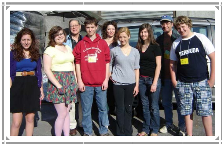
Nightwatch picture: The Pilgrims at the Cathedral of St. John the Divine in New York City

Thank you parish and friends for another successful carwash! We gathered in nearly $750. The pilgrims depart for Ireland the afternoon of Tuesday, June 29 and return on July 8. Come send them off with a prayer at 2pm at the River Street parking lot.